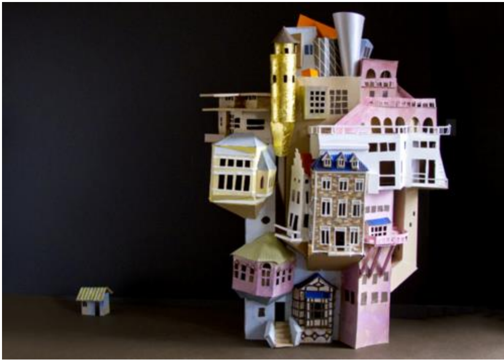
Doyle partners for Vanity Fair Magazine