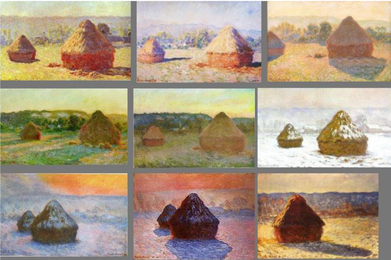
Claude Monet, Haystacks 1890-1891

Look at the different ways Monet used color to depict the time of day and season. What kind of color schemes do you notice?