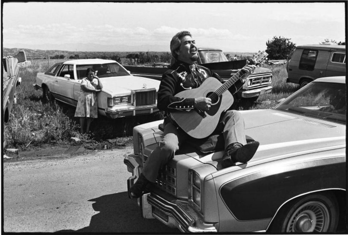
Kevin Bubriski's "El Rito Fiesta," 1981, is an archival pigment ink print, edition of 25.